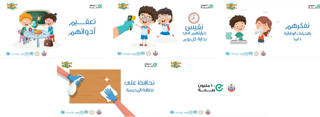
Figure 3. Screenshots for video 3

https://www.facebook.com/egypt.mohp/videos/2530318647266777