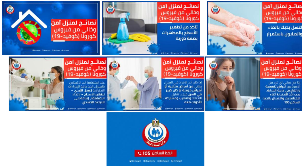
Figure 1. Screenshots for video 1

https://www.facebook.com/egypt.mohp/videos/77333585672428