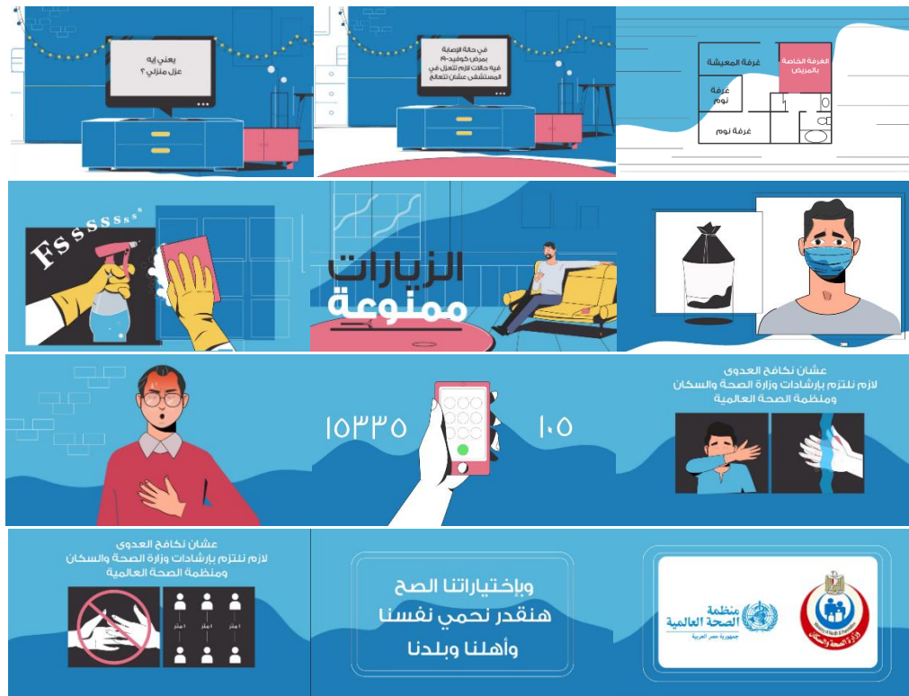
Figure 2. Screenshots for video 2

https://www.facebook.com/egypt.mohp/videos/77333585672428