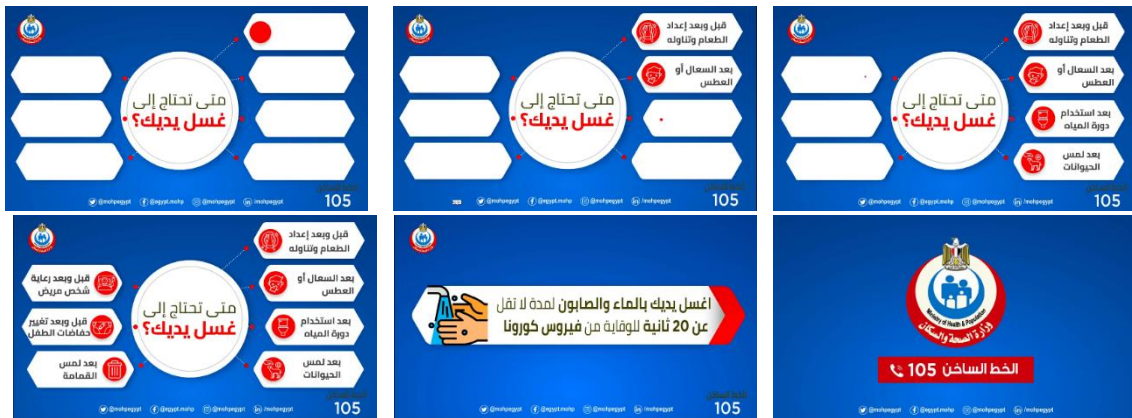
Figure 4. Screenshots for video 4

https://www.facebook.com/egypt.mohp/videos/2530318647266777