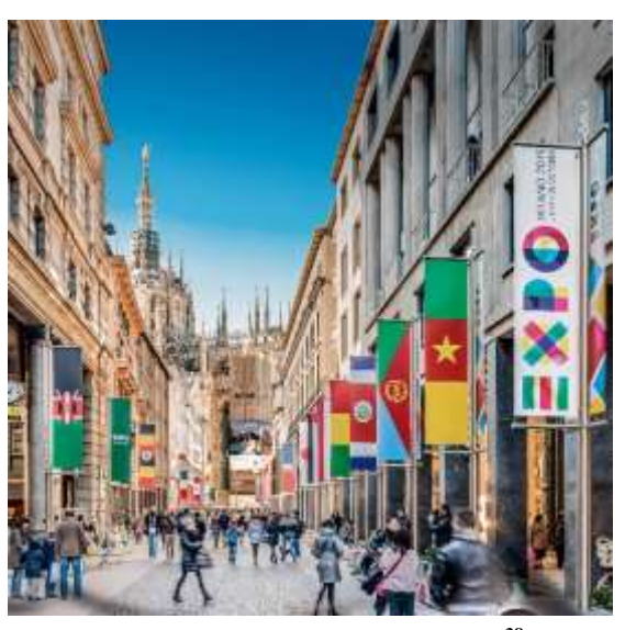
Figure 8: Guests' countries flags<sup>38</sup>