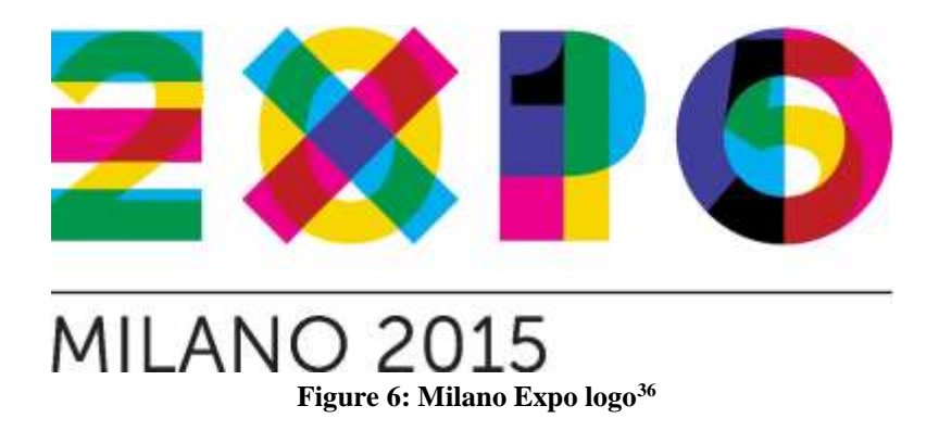
Figure (6) represents the logo of Milano Expo. It is designed mainly using typography. It is the word "Expo" overlapping with the term "2015" in different colors and opacities. The green color that is used in the logo is the same tone that existed already in the Italy flag colors. The different colors and tones conveyed a message of diversity of the different colors of food, which is the main object of the event and the diversity of the participated countries to confirm the message of the campaign's slogan which was feeding the planet.

They used to print the flag in different places as presented in figure 7 and the flags of the guest's nations as shown in figure 8 that in turn may indicate that they are a welcoming country and it will reflect positively on its national image.