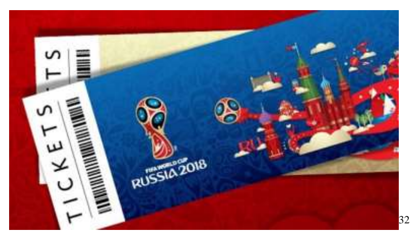
Figure 4: Russia FIFA World Cup ticket

They made many environmental designs that used in most of them the name "Russia 2018" in its unique red color to enhance the identity and the national image as presented in figure (5).