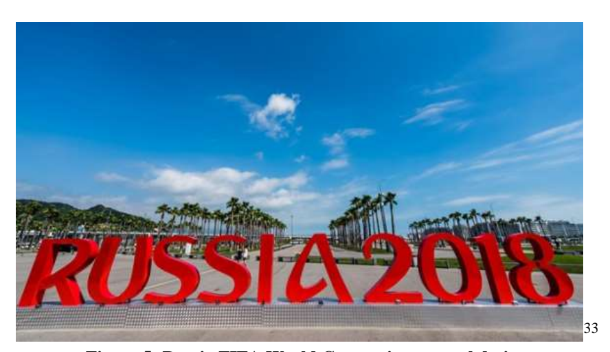
Figure 5: Russia FIFA World Cup environmental design

They made many environmental designs that used in most of them the name "Russia 2018" in its unique red color to enhance the identity and the national image as presented in figure (5).