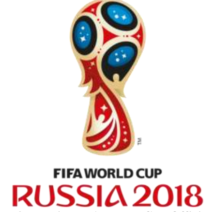
Figure 2: Russia FIFA World Cup Official logo

In all of their designs they were punctual on using the identity colors that are inspired of the flag colors. Most of their designs they used the red color more such as the official book cover that presented in figure (3). They used graphic illustrations to famous landmarks in Russia to make the audience connect between football and the national image. They also wrote the word (Russia) in the first one third of the advertising to be more obvious.