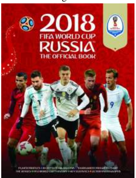
Figure 3: Russia FIFA World Cup official book cover 31

In all of their designs they were punctual on using the identity colors that are inspired of the flag colors. Most of their designs they used the red color more such as the official book cover that presented in figure (3). They used graphic illustrations to famous landmarks in Russia to make the audience connect between football and the national image. They also wrote the word (Russia) in the first one third of the advertising to be more obvious.