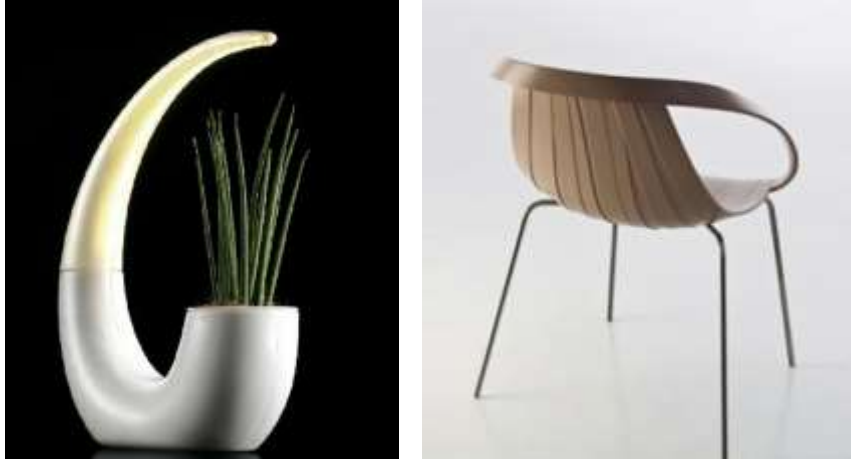
Some models of liquid wood products (26)