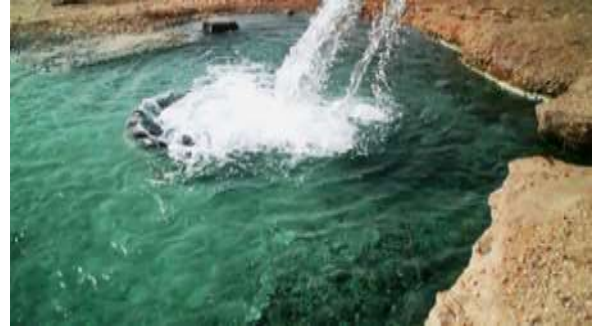
Lakes of Siwa Oasis (22)