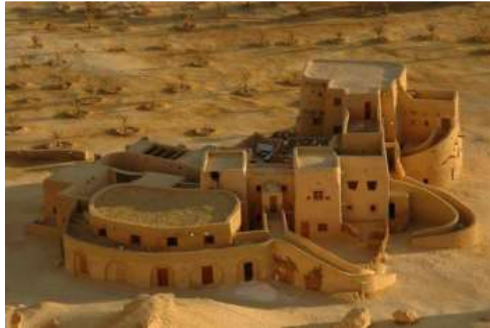
Kafr Dalhab Oasis Hotel. (25)

From the foregoing, it turns out that the key element in the establishment of the ecological hotel is access to the process of integration and integration with the weather, culture and nature in the surrounding area.