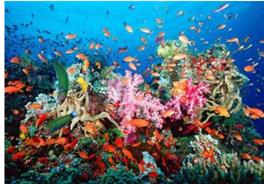
Diving in Sharm El Sheikh (21)