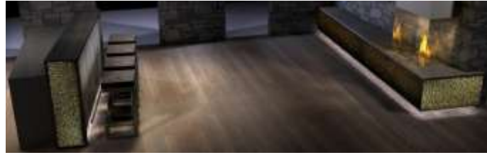
Figure 16 a living room with illuminated fireplace and bar