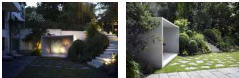
Figure 8 Garden Pavilion, Zurich, Switzerland

The figure (8) shows two shots of the Garden Pavilion, Zurich, Switzerland. This idea was to create a simple structure, which would sit quietly in the garden; the designer wanted the pavilion to create a shelter. This pavilion has a space defined by five translucent precast concrete panels connecting floor, walls and roof, but at the same time allow a subtle perception of the garden and the sunlight, and it allowed the surrounding colors, shapes, movements and shadows to be perceived from the interior. Therefore, the translucent concrete allows the pavilion to be alive too. As the light conditions change in time, the surfaces change and vary from heavy to light, from solid to translucent. (2)