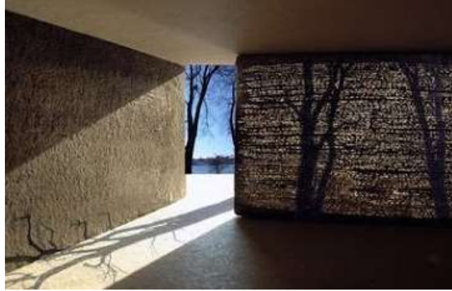
Figure 6 using the translucent concrete in Walls

Figure (7) shows the application of transparent concrete panels in form of a partition wall in “Europe Point” – Millenáris Park – Budapest – Hungary. (2)