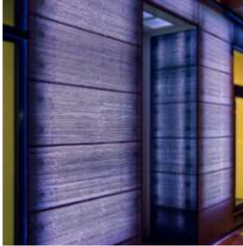
Figure 9 transparent concrete panels uses in wall cladding

The transparent concrete panels can be used for wall cladding that embedded optical fibers transport the light from the backlight to the surface without loss. This creates a translucent look and the light concrete begins to shine fascinatingly from the inside out. Figure (9).