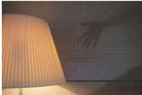
Figure 7 the application of transparent concrete panels in form of a partition wall in “Europe Point”

Figure (7) shows the application of transparent concrete panels in form of a partition wall in “Europe Point” – Millenáris Park – Budapest – Hungary. (2)