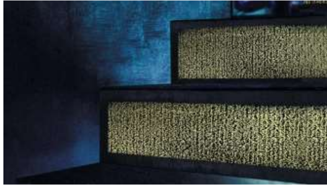
Figure 13 the stairs illuminated from bellow