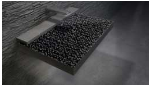
Figure 19 washing basin

The figures (19 – 20) show the game of light and water drops in the washing basin and the shower basin.