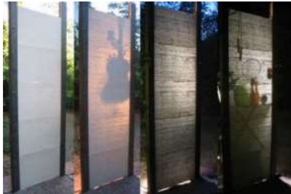
Figure 4 translucent concrete aesthetical properties