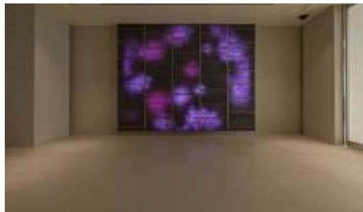
Figure 10 transparent concrete wall cladding, located in the lobby of the studio Hibiya, in Tokyo, Japan

The figure (10) shows the application of black transparent concrete blocks in form of a thin wall made of 25mm thick is located in the lobby of the studio Hibiya, in Tokyo, Japan. There is a projection room behind; in this manner, one can see videos, moving images on the wall.