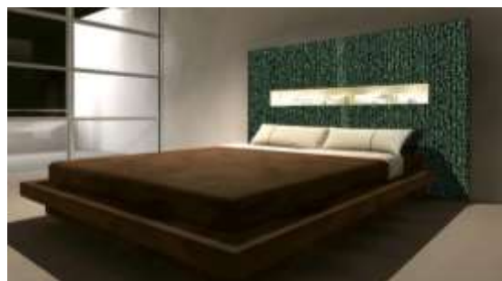
Figure 15 a bed with a head part made of translucent concrete with changing colors

The furniture made of translucent concrete can be lit from the front and the side, to give aesthetic view. The figure (15) shows a bed with a head part made of translucent concrete with changing colors, and the figure (16) shows a living room with illuminated fireplace and bar for relaxed evenings. (1)