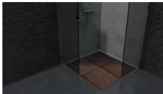
Figure 20 shower basin