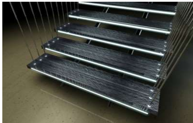
Figure 14 the stairs with linear LED fixtures