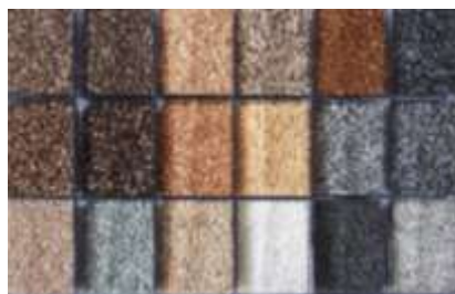
Figure 5 transparent concrete colors and shapes