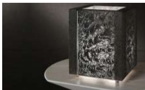
Figure 18 an exclusive ambient lamp – litracube lamp – made out of translucent concrete

Lamps using translucent concrete blocks with a light source would add a great deal of aesthetic look. (8) The figure (18) shows an exclusive ambient lamp – litracube lamp – made out of translucent concrete, designed by Aron Losonczy, with the size of 221x175x175mm. (2)