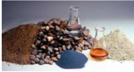
Figure 1 Concrete components.

Optical Fiber: is a material from sensing field, has a good light guiding property which can be arranged to transmit the sun light or the artificial light according to pre-design road without light-heat, light-electrical or photochemical process, and photo elastic effect. (6) Fiber optics are long, thin strands of very pure glass, about the size of a human hair. They are arranged in bundles – figure (2) – called optical cables. In addition, used to transmit signals over long distances. (22)