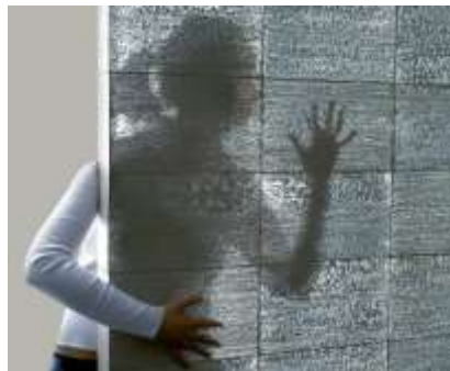
Figure 17 Translucent Concrete partition