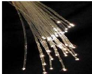
Figure 2 optical fiber bundles

Optical Fiber: is a material from sensing field, has a good light guiding property which can be arranged to transmit the sun light or the artificial light according to pre-design road without light-heat, light-electrical or photochemical process, and photo elastic effect. (6) Fiber optics are long, thin strands of very pure glass, about the size of a human hair. They are arranged in bundles – figure (2) – called optical cables. In addition, used to transmit signals over long distances. (22)