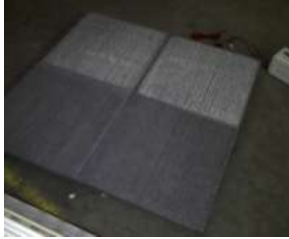
Figure 11 the difference between the illuminated panels and dark panels