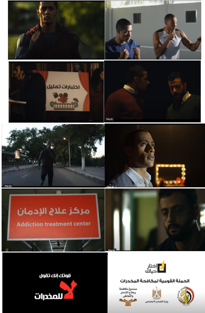
Fig. 3 The second advertisement of the campaign "You are stronger than drugs" by Mohamed Ramadan

A survey research design was adopted for the study and a questionnaire- was designed, keeping in view the objective of the study- has been used as a data collection tool.