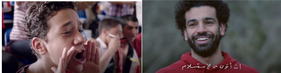
Fig. 2 The first advertisement of the campaign "You are stronger than drugs" by Mohamed Salah