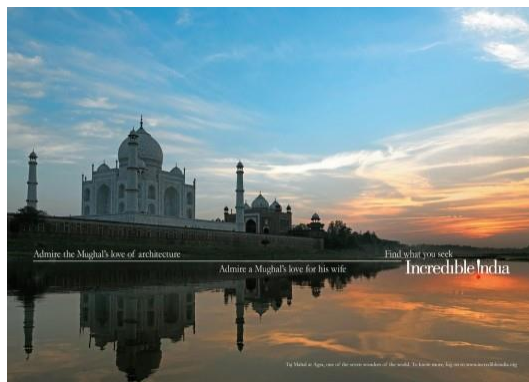
Figure 5 25

They used pictures of huge colors festivals they are famous of as festivals in India are too unique and are not seen or experienced anywhere as shown in figure 6(a+b).