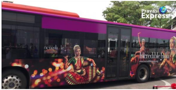
Figure 9(a) 30