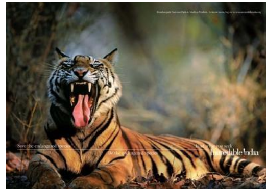
Figure 8 29