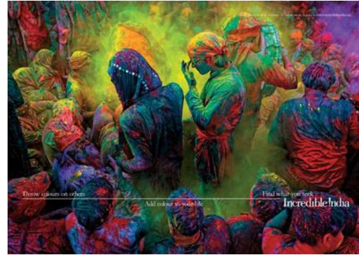
Figure 6(b) 27

They usually used women models with unique features that include their long hair, and their skin color wearing different colors and costumes that are considered Indian folklore as presented in figure 7. Also they used in their ads different animals they are famous of such as the tiger as shown in figure 8.