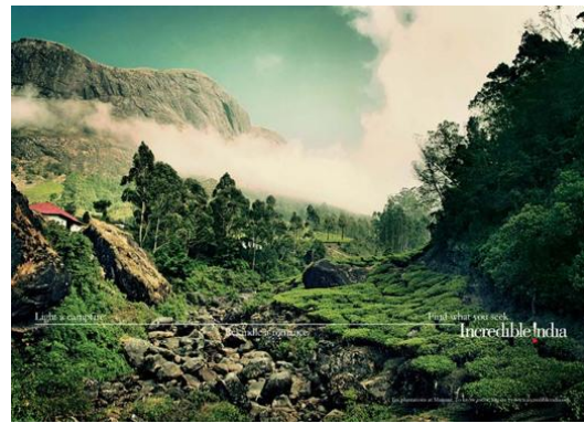
Figure 3(b) 24

They also advertised about their famous monuments as shown in figure 4 or used tourists’ favourite destinations such as Taj Mahal as it is the one of the world’s most beautiful buildings as presented in figure 5