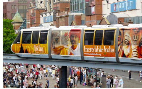
Figure 9(b) 31