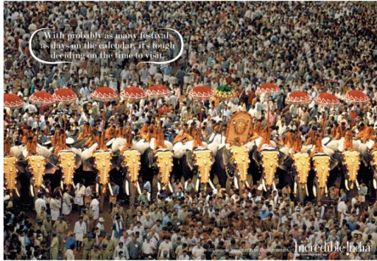
Figure 6(a) 26