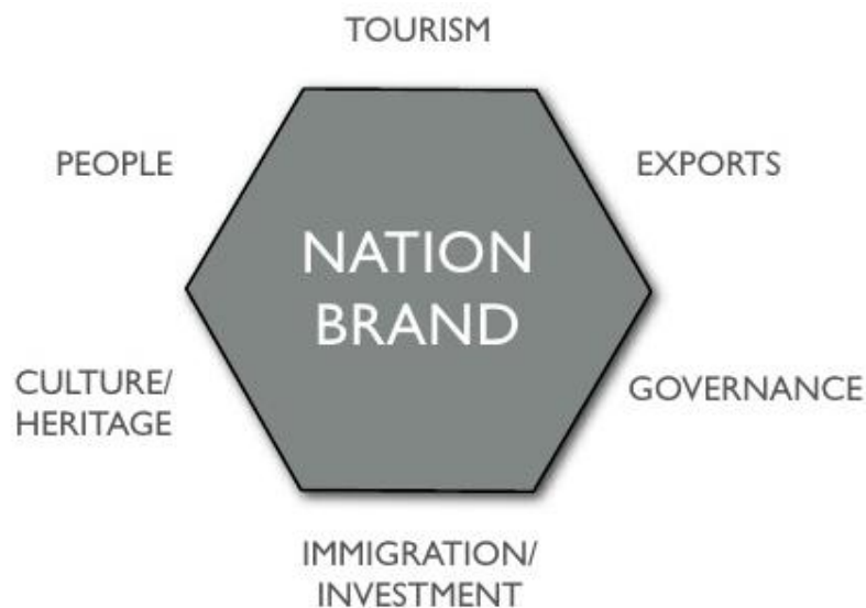
Figure No. 1: Anholt nation brand hexagon 18

The nation brand is the unique, multi-dimensional blend of elements that provide the nation with culturally grounded differentiation and relevance for all of its target audiences. 16 The nation brand is the sum of people's perceptions of a country across six areas of national competence. Together, these areas make what is called the Nation Brand Hexagon illustrated by Simon Anholt 17 in the figure below.